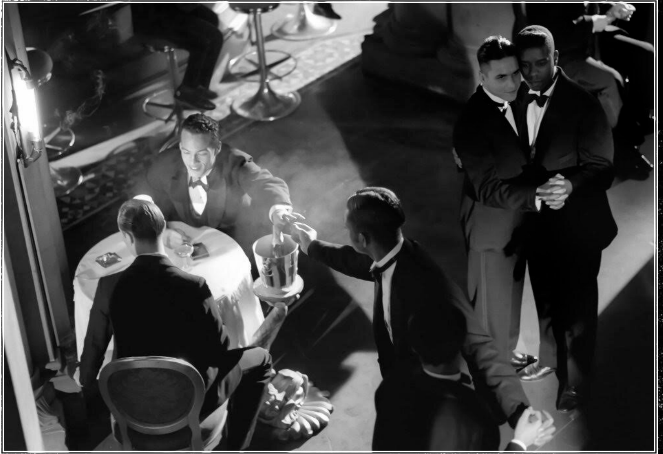
RENAISSANCE CASINO, 1938 NYC